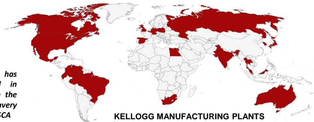
KELLOGG MANUFACTURING PLANTS

We work with over 20,000 Tier 1 suppliers. Agricultural commodities, including corn, wheat, potato flakes, vegetable oils, sugar and cocoa, are the principal raw materials used in our products and carton board, corrugated, and plastic are the principal packaging materials.